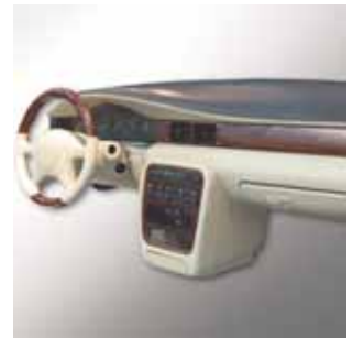
PX 245 / PX 245 L

Off white resin similar to high flexural modulus ABS or ABS/PC blends. Suitable for low tension electrical equipments like casings for circuit breakers or switches as well as for House hold appliances parts; coffee machines, vacuum cleaner and casings for medical equipments. Also in long pot life version of 8 minutes for large parts.