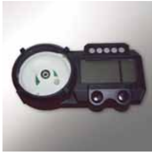
PX 223 HT

Used by casting for the production of prototype parts and mock-ups whose mechanical properties are close to ABS or filled PP. Thermoplastic-like resistance in temperature (TG > 180°C). Almost no change of mechanical properties after ageing under temperature. Good resistance to automotive fluids (except brake liquid). According to its exceptional compatibility with silicone moulds it's possible to achieve easily 50 castings in a mould without deterioration.