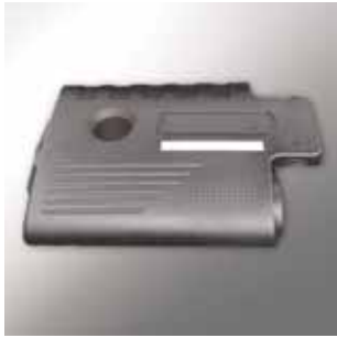
PX 2017 HT

Used by casting for the production of prototype parts and mock-ups whose mechanical properties are close to ABS or filled PP. Thermoplastic-like resistance in temperature (TG > 180°C). Almost no change of mechanical properties after ageing under temperature. Good resistance to automotive fluids (except brake liquid). According to its exceptional compatibility with silicone moulds it's possible to achieve easily 50 castings in a mould without deterioration.